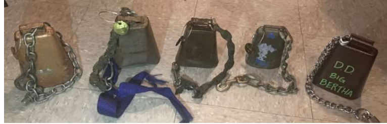
From left to right cowbell 1, 2, 3, 4 and 5