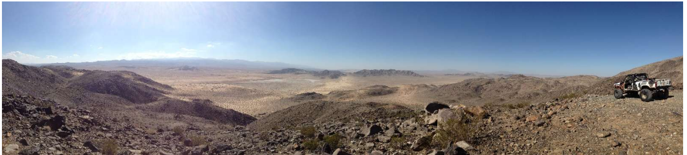
Means Dry Lake after it rained 4 inches in 18 hour period October 2018.